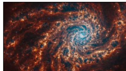
Spiral galaxies (James Webb Space Telescope)