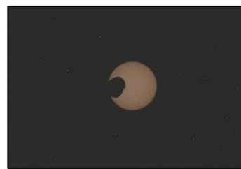
Solar eclipse by Phobos, moon of Mars (Perseverance rover)