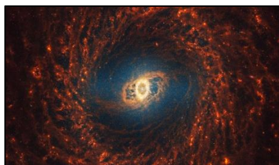
Spiral galaxies (James Webb Space Telescope)