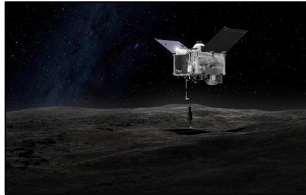
Artist's rendition of OSIRIS-REx

During close fly-bys in 2019 to get a high-resolution look at the surface, instruments caught Bennu unexpectedly spewing debris into space. The fly-bys also allowed for a detailed examination of the most likely target for the upcoming touch-down: a crater nick-named "Nightingale". Nightingale is only about the size of a few automobile parking spaces, but it's one of the few sites where boulders are not as plentiful and there appeared to be an abundance of fine material to collect.