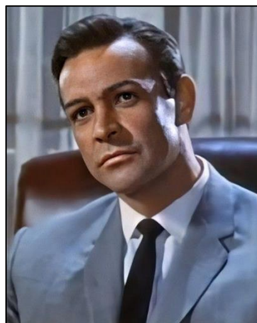
Sean Connery 1930 - 2020

July 9-11, 2021 SHORE LEAVE 42 ( rescheduled from July 2020). Delta Hotels Marriott Baltimore Hunt Valley (Hunt Valley MD). Actor GoH: Denis Lawson ( Star Wars "Wedge Antilles"); Brandon Routh (Superman & The Atom); Robert Duncan McNeill (Lt. Tom Paris); Brent Spiner (Data); Alex Kingston (River Song). Membership: $105 for the weekend ($120 at the door); daily rates available. Printable registration forms & on-line registration available through the Registration Page. Website: https://www.shore-leave.com/info/update-2020-04-25.htm