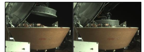
NASA Images of the collector head being stowed into the SRC

The mission team spent two days working around the clock to complete the stowage procedure. The process required the team's continuous oversight and input, assessing images and telemetry each step of the way before moving on to the next step. (Remember, Mission Control is over 200 million miles away from OSIRIS-REx; and there's a time delay of slightly more than 18 minutes while signals to travel between them.) By the evening of October 27 th , the TAGSAM arm had placed the collector head into the SRC. The following morning, the mission team verified that the collector head was thoroughly fastened into the capsule; and the TAGSAM arm was disconnected from the sampler head and the SRC was closed. The Bennu samples were safely stored and ready for the return trip to Earth.