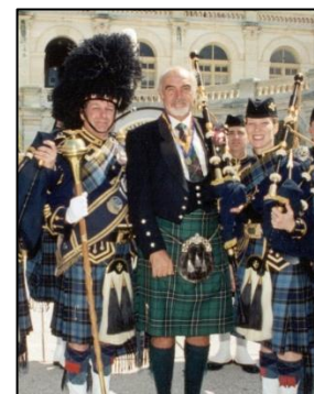
Connery at a Tartan Day celebration in Washington D.C. (wearing the green-and-black hunting tartan of his mother's MacLean clan)

Connery's acting achievements were recognized with an Oscar (Best Supporting Actor, The Untouchables , 1987), two BAFTA Awards, and three Golden Globes. In 1987, he was made a Commander of the Order of Arts and Letters in France. In 1999, he received the US Kennedy Center Honors Lifetime Achievement Award. And in 2000, he was knighted by Queen Elizabeth II for services to film drama. People magazine voted him the "Sexiest Man Alive" in 1989 and the "Sexiest Man of the Century" in 1999.