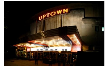
Uptown Theater 1936 – 2020

We were reminded at the November LSF meeting (held via Zoom) that the Uptown Theater (DC's last "big screen" film venue) had permanently closed. Its final day of operation was March 12 th ; and the last film screened at the theater was Pixar's Onward .